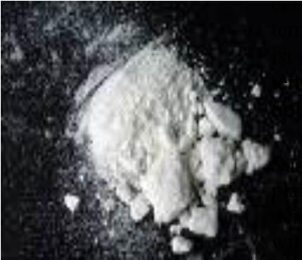
This substance above is only a small dosage of crack cocaine compared to the approximate millions of dollars worth that was generated around Pittsburgh.